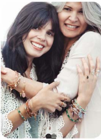
ALEX AND ANI