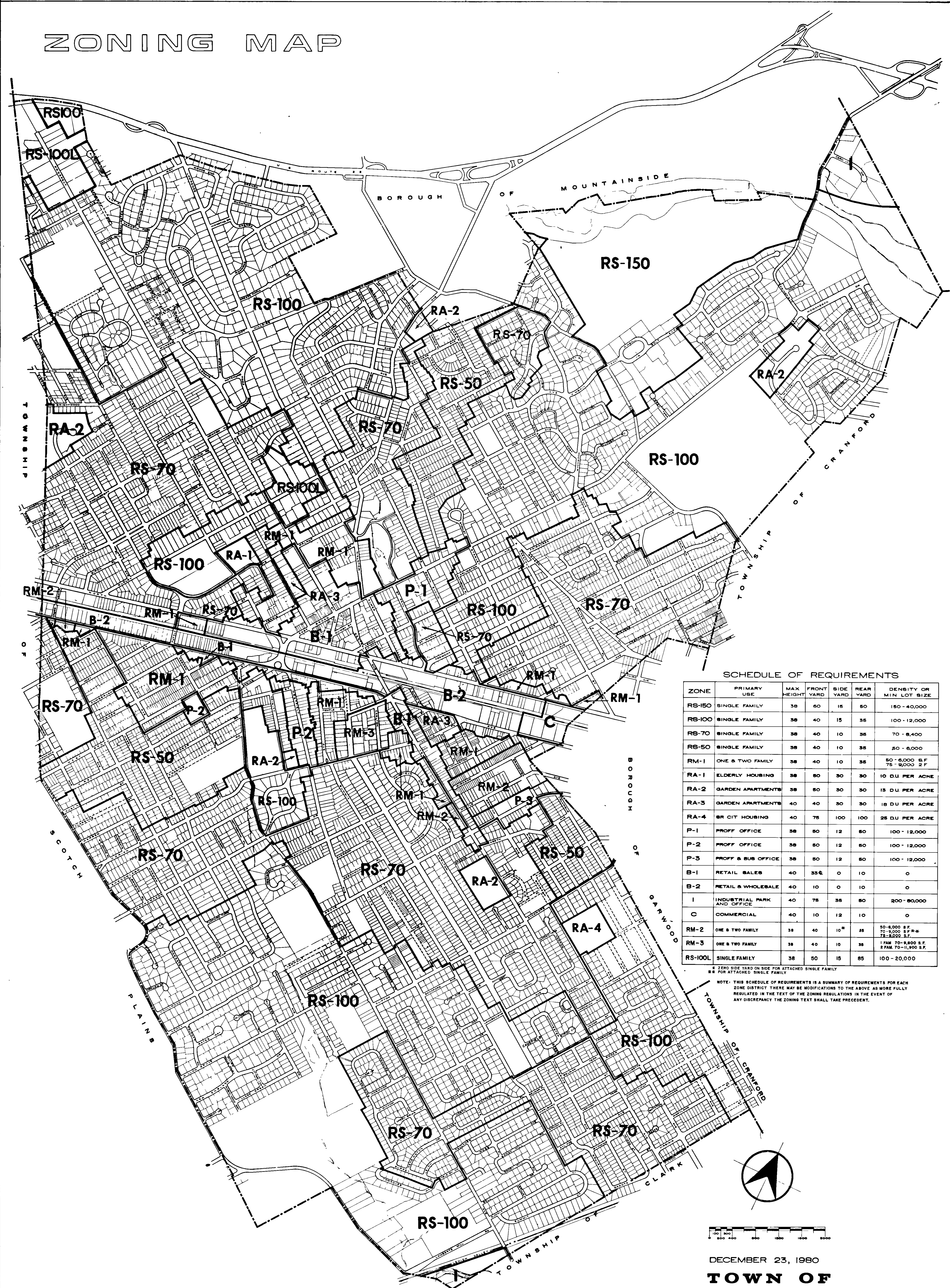
SCHEDULE OF REQUIREMENTS